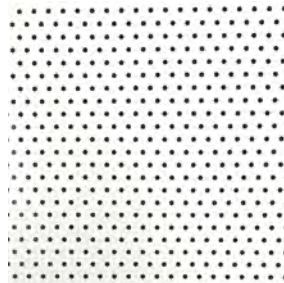
BRIGHT WHITE 29ga, 26ga & 24ga

1/8" @ 3/8" 60 Degree Stagger 10.1% O.A.